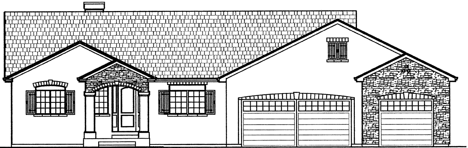
FRONT (WITH MINI-MASTER SUITE)

Standard 4-Car Garage (Additional Garage Bays Optional)